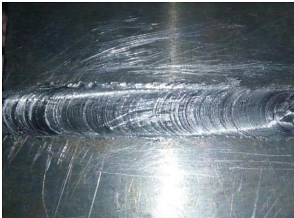
Fig 3: Snapshot of AA Plates Welded at 1200 rpm

The welded plates can be seen in the Fig. 3 below which was welded using the threaded tool at 1200rpm with a feed of 25mm/min. The welded plates were first sectioned according to the tensile specimen test dimension standards and the tensile strength test was conducted on the Universal Testing Machine (UTM).