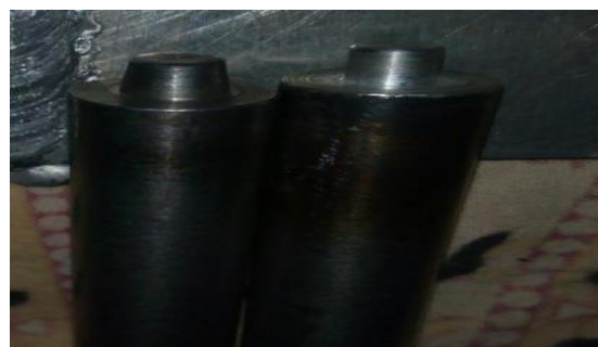
Fig 2: Tool Snapshot: 1) Tapered (Left) 2) Cylindrical (Right)