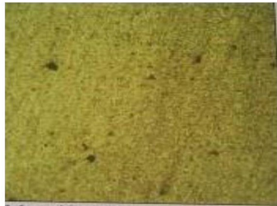
Fig 4: Microstructure Image at Magnification 200X

The test was conducted as per the ASME guidelines and was free from cracks and voids. The slag and inclusions level were found to be satisfactory.